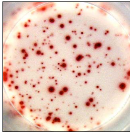
Stimulus: Concanavalin A ( 2 \times 10^5 cells/well)

Example of IL-4 specific spots produced by rat (BN) splenocytes. Preincubation: 42h, incubation ELISPOT: 20h.