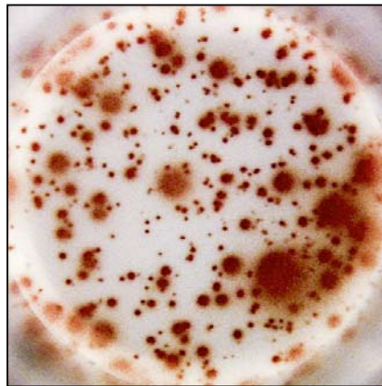
Stimulus: PMA/ionomycin ( 1 \times 10^4 cells/well)

Example of IFN- \gamma specific spots produced by rhesus macaque PBMC. Preincubation: 42h, incubation ELISPOT: 20h.