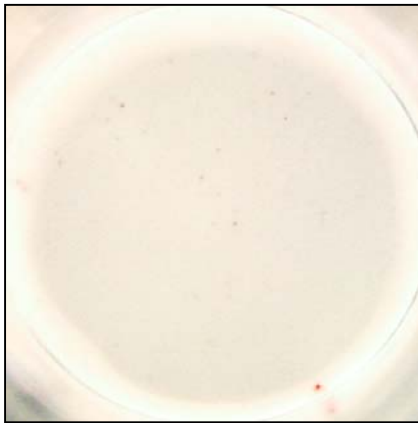
Stimulus: none ( 4 \times 10^5 cells/well)