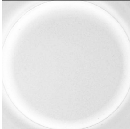
Stimulus: none ( 2 \times 10^5 cells/well)