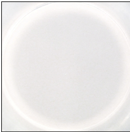
Stimulus: none ( 2 \times 10^5 cells/well)