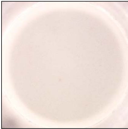
Stimulus: none ( 2 \times 10^5 cells/well)

Rhesus macaque, Cynomolgus monkey, Mandrill