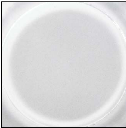
Stimulus: none ( 4 \times 10^5 cells/well)