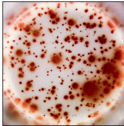
Stimulus: PMA/ionomycin ( 1 \times 10^4 cells/well)

Example of IFN- \gamma specific spots produced by rhesus macaque PBMC. Preincubation: 42h, incubation ELISPOT: 20h.